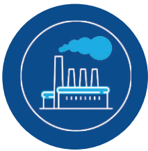
INDUSTRIAL & COMMERCIAL