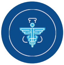
ANALYTICAL & MEDICAL